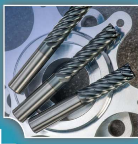
IMCO CARBIDE TOOL'S Pow•R•Path IP Cutting Tools

Record orders and deliveries in 2015 will be hard to top, but a generous backlog will keep manufacturers busy.