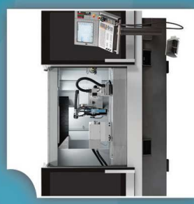
HARDINGE GROUP'S Kellenberger VARIA Cylindrical Grinding Machine