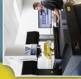
OPTICAL GAGING PRODUCT'S SmartScope Quest 800 CMM