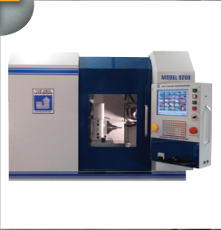
UNISON'S Model 9200 CNC Tool/Cutter Grinder