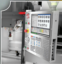
HAAS AUTOMATION'S Next Generation Control